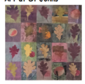
Art at St Johns

Canned/tinned goods, Jars of cooking sauces, Pasta, Rice, long life milk, juice, biscuits etc Thank you very much any support you can give will be greatly appreciated.