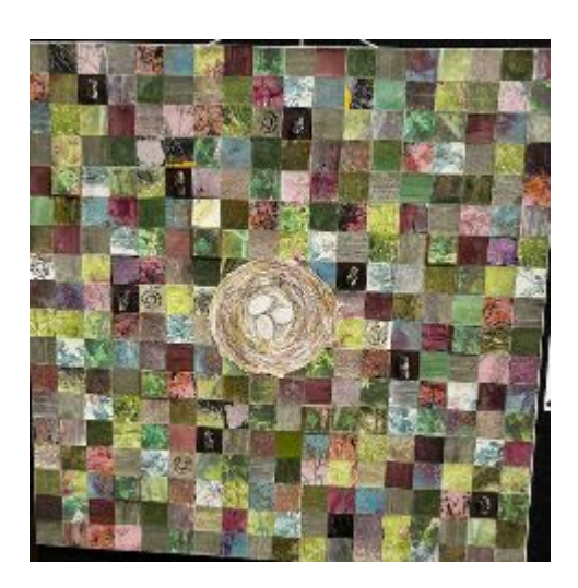
Art at St John's

or use the laminate sheet in the kitchen to look at what area/s may need some attention (Please do record what area you clean so that others are aware)